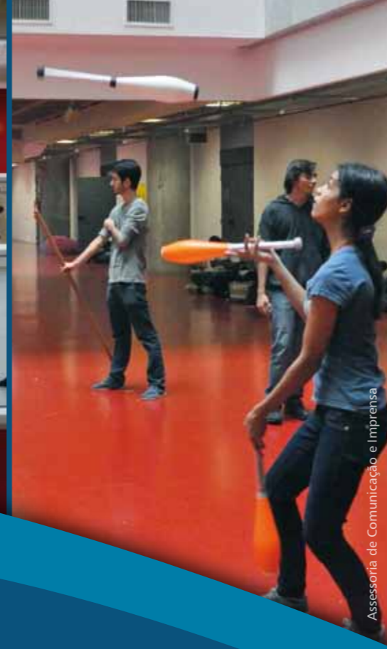
Assessoria de Comunicação e Imprensa