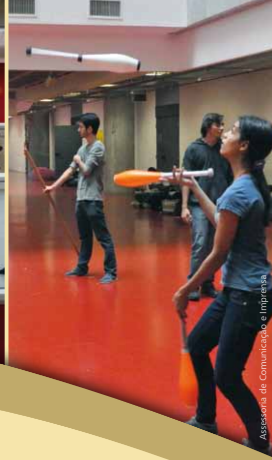
Assessoria de Comunicação e Imprensa