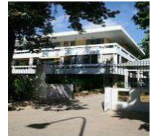
New Dehli (2006)