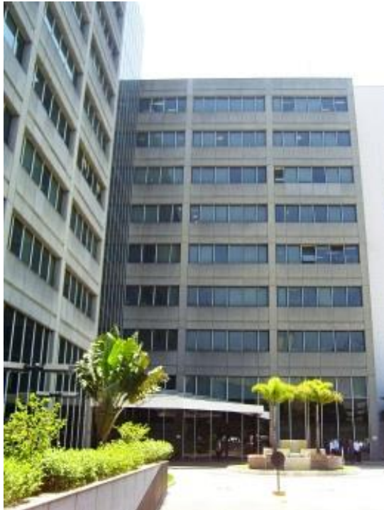
São Paulo (2011)

Through its representative and liaison offices abroad