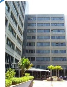
São Paulo (2011)