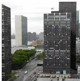
New York (2007)