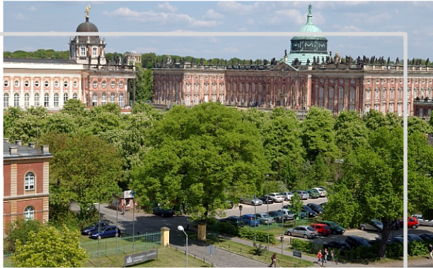
Am Neuen Palais